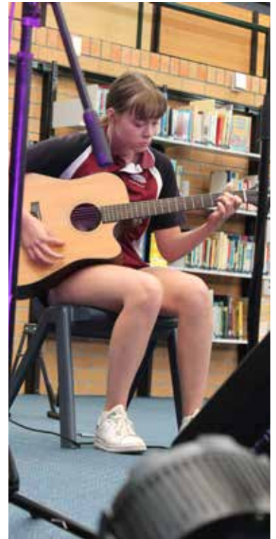
CAPA Concert and Exhibition - congratulations to students and staff!