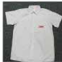
JUNIOR BOYS BLUE SHIRT Year 7 - 10 $27 Sizes available 6 - 2XL