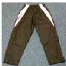
UNISEX TRACK PANTS All years $38 Sizes available 8, 10, 12, XS, M, L, XL