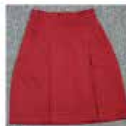
SENIOR GIRLS SKIRT Maroon with box pleats Year 11 & 12 $35