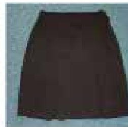
JUNIOR GIRLS SKIRT Black with box pleats Year 7 - 10 $35