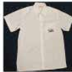
SENIOR BOYS SHIRT Year 11 & 12 $27 Sizes available 10 - 2XL