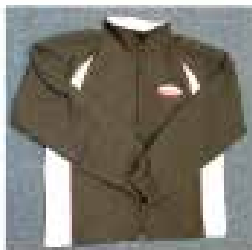
UNISEX JACKET All years $60 Sizes available 8 - 3XL