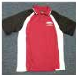
UNISEX POLO SHIRTS All years $35 Sizes available 8 - 6XL also PE/Sport shirt