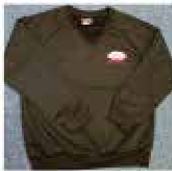
UNISEX JUMPER All years $30 Sizes available 8 - 4XL