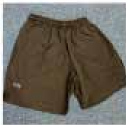
UNISEX SHORTS All years $25 Sizes available 8 - 5XL also PE/Sport shorts