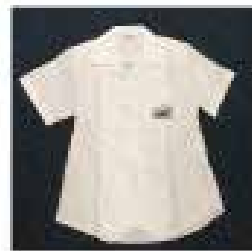
SENIOR GIRLS BLOUSE Year 11 & 12 $30 Sizes available 6 - 18