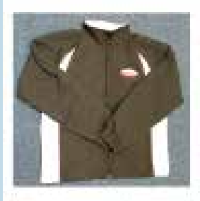
UNISEX JACKET All years $60 Sizes available 8 - 3XL