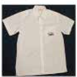
SENIOR BOYS SHIRT Year 11 & 12 $27 Sizes available 10 - 2XL