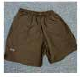
UNISEX SHORTS All years $25 Sizes available 8 - 5XL also PE/Sport shorts