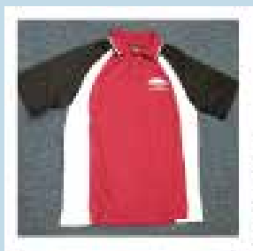
UNISEX POLO SHIRTS All years $35 Sizes available 8 - 6XL also PE/Sport shirt