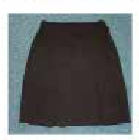
JUNIOR GIRLS SKIRT Block with box pleats Year 7 - 10 $35