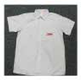
JUNIOR BOYS BLUE SHIRT Year 7 - 10 $27 Sizes available 6 - 2XL