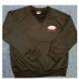
UNISEX JUMPER All years $30 Sizes available 8 - 4XL