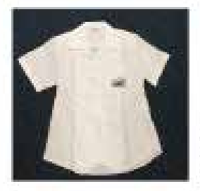
SENIOR GIRLS BLOUSE Year 11 & 12 $30 Sizes available 6 - 18