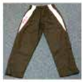
UNISEX TRACK PANTS All years $38 Sixes available 8, 10, 12, XS, M, L, XL