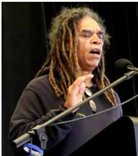
NAIDOC 2022 Assembly