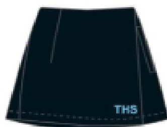
Black Skirt with Sky Blue THS