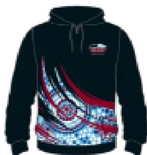
First Nations Hoodie