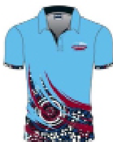
First Nations Polo Shirt