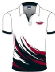
School Senior Polo Shirt