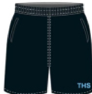
Black Shorts with Sky Blue THS