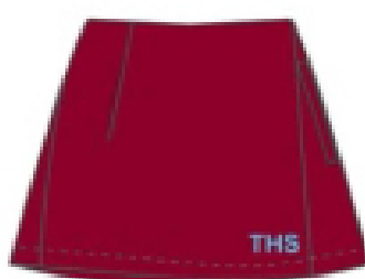
Maroon Skirt with Sky Blue THS

The juniors will have the option of the Black Skirt and Seniors will have the option of the Maroon Skirt