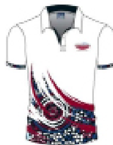
First Nations Senior Polo Shirt

Students will be able to wear either the First Nations or non-First Nations shirt and Hoodie