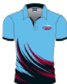
School Polo Shirt

Our P&C have reviewed the results of the uniform survey and have approved the design of the uniform. Thank you to every parent, student and staff member that completed the survey. The final designs are below. The uniform will be available for the commencement of the 2024 school year. The current uniform will continue to be able to be worn but will no longer be able to be purchased once the new uniform arrives.