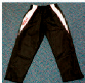
UNISEX TRACK PANTS All years $40 Sizes available 8, 10, 12, XS, M, L, XL