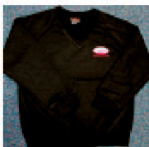
UNISEX JUMPER All years $35 Sizes available 8 - 4XL