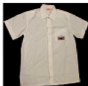
SENIOR BOYS SHIRT Year 11 & 12 $32 Sizes available 10 - 22