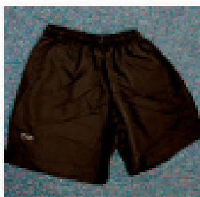
UNISEX SHORTS All years $35 Sizes available 8 - 5XL also PE/Sport shorts