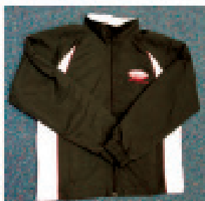
UNISEX JACKET All years $65 Sizes available 8 - 3XL