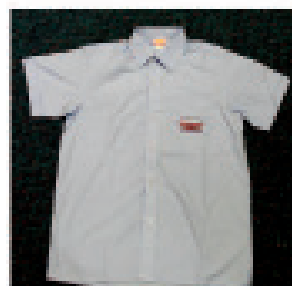
JUNIOR BOYS BLUE SHIRT Year 7 - 10 $32 Sizes available 6 - 2XL