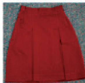
SENIOR GIRLS SKIRT Maroon with box pleats Year 11 & 12 $35