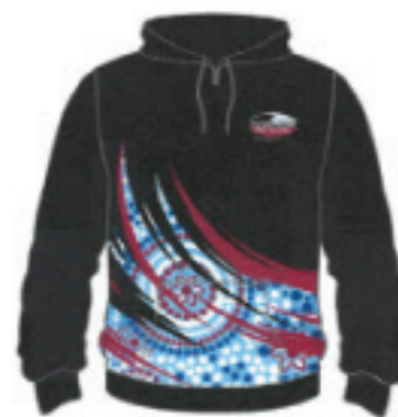
First Nations Hoodie $65