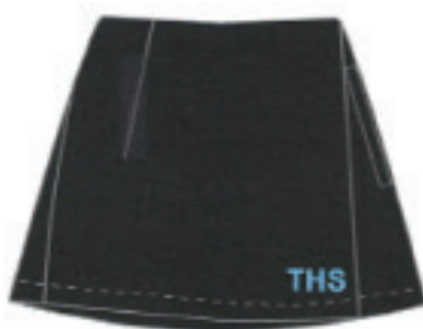
THS Black Skirt $35