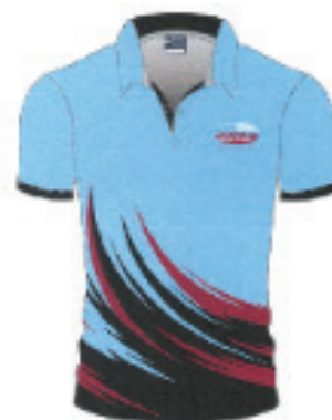
Junior Polo $40