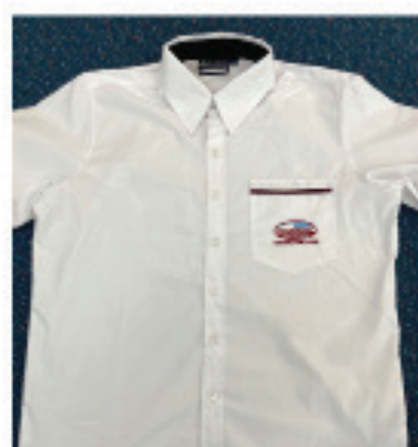
Senior Formal Shirt $35