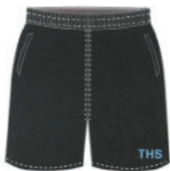
THS Black Shorts $26