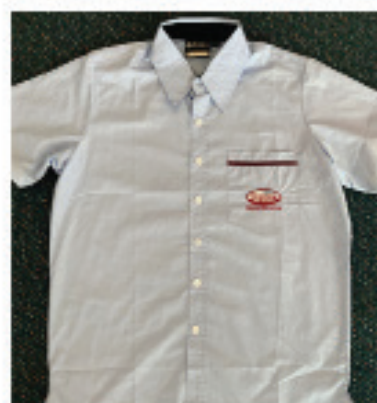
Junior Blue Formal Shirt $35