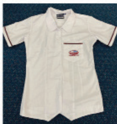
Senior Formal Blouse $35