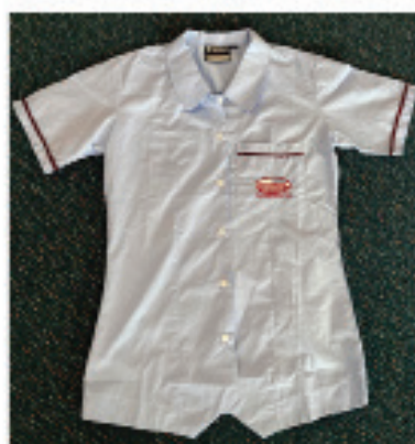
Junior Blue Formal Blouse $35