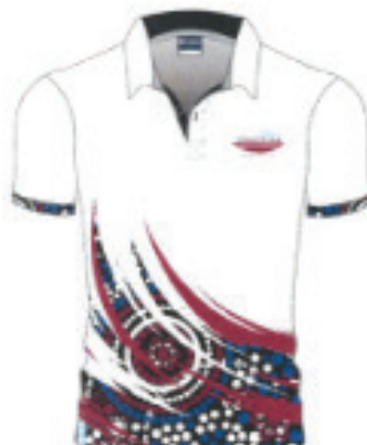
Senior First Nations Polo $40