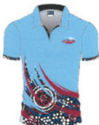
Junior First Nations Polo $40