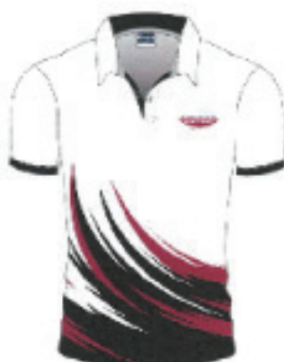
Senior Polo $40