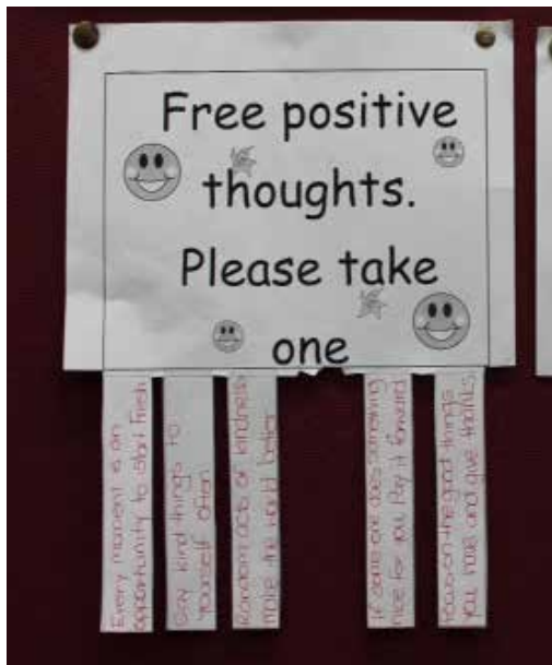
Spotted on the notice board FREE POSITIVE THOUGHTS!