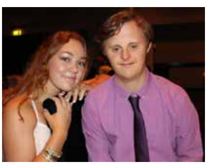
We have celebrated the Year 10 & Year 12 Formals at Opal Cove in recent weeks. The formals were brilliant nights enjoyed by all! More photos on the THS website.