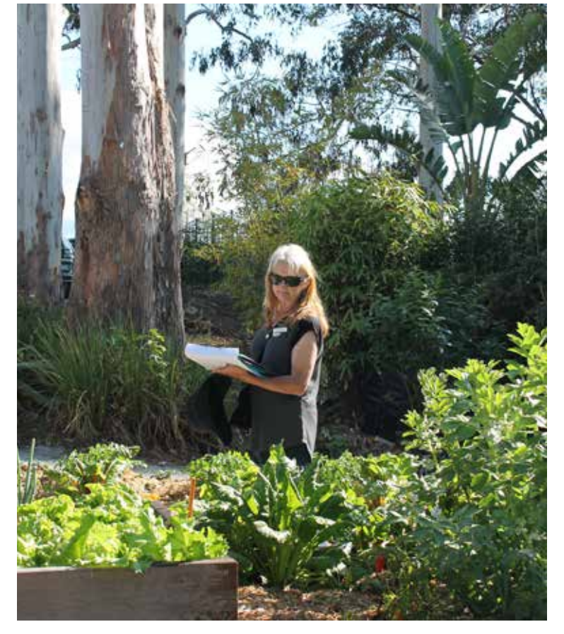
Photo shows one of the judges in the THS Support Unit vegetable garden.

Staff and students of the THS Support Unit were excited to have their vegetable garden judged in two sections of this years' Coffs Harbour Garden Club Spring Competition in the school section. The judges expressed the 'wow' factor upon seeing our growing garden area. The garden has also been attracting positive attention from most staff who enter the school from the western entrance to our school.