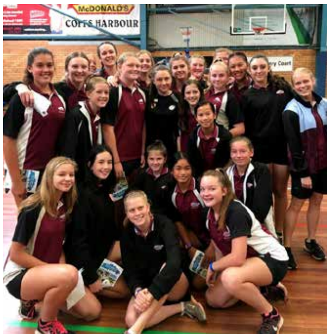
Girls Get Active Day