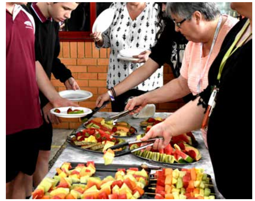
All things FRUIT were celebrated in the Support Unit during FRUITOPIA! Yum yum yum.