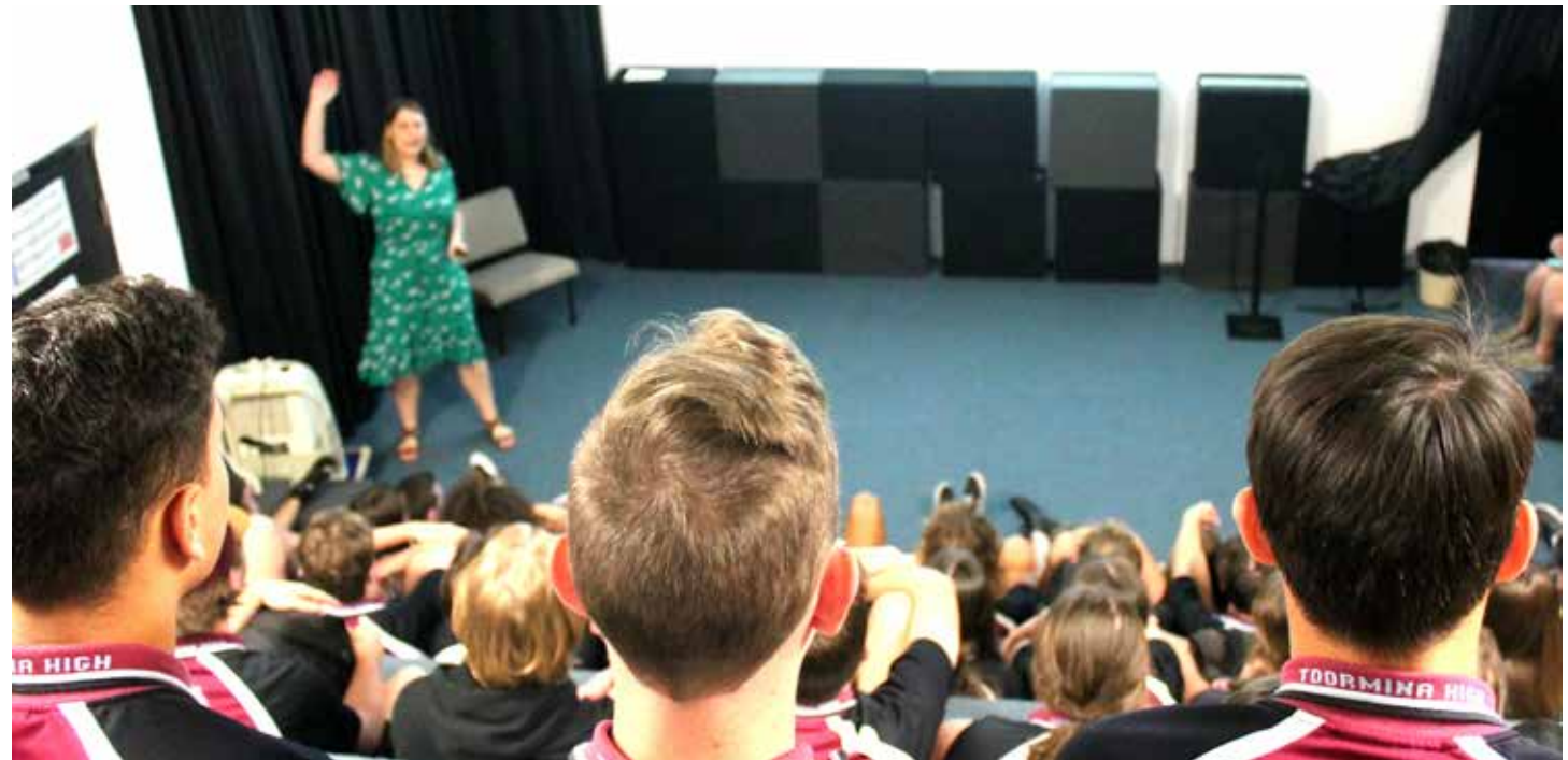
Photo above is from the Headspace workshops held in our TLA (Tiered Learning Area). These workshops provide information on mental health support networks available to students.