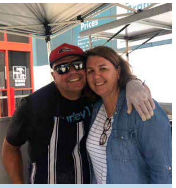
THANK YOU to P&C members, staff and students who worked at the Bunnings BBQ!