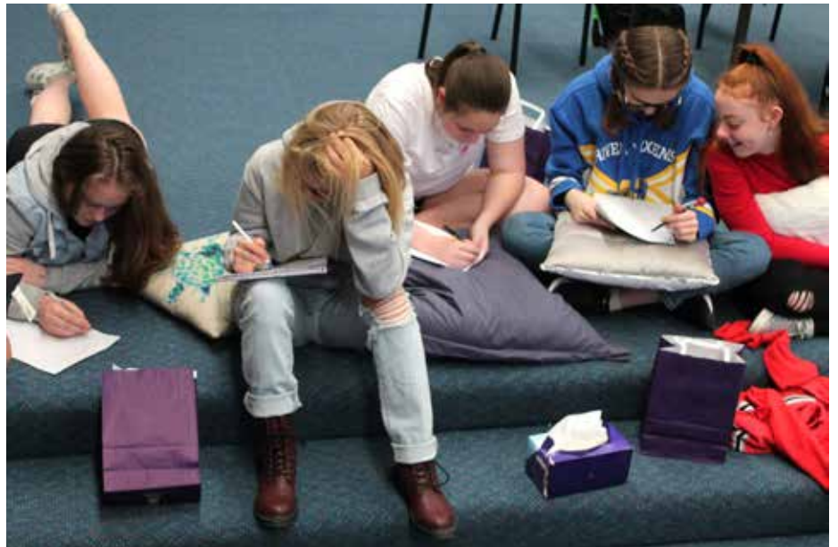
Year 9 Girls 'The Butterfly Effect' Workshop

We believe in providing multiple opportunities (within the school framework) to build resilience in every student; from participation in our workshops, through to supporting schools in evaluating their strategies and policies in mental health and other key pastoral areas.