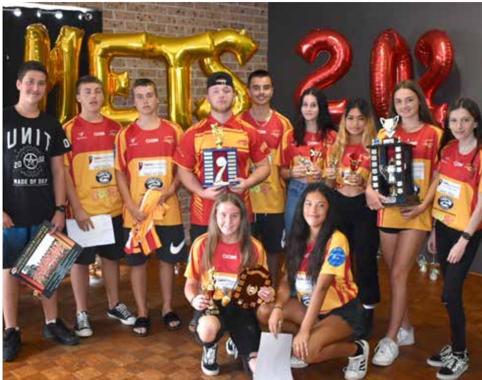
Congratulations to the THS students who were in the Grand Final winning Coffs Comets Girls League Tag and Boys Under 15's teams for 2020!

Thursday, November 12 Pacific Bay Resort 6pm - 9pm Please RSVP by November 5 Cost $65 pp