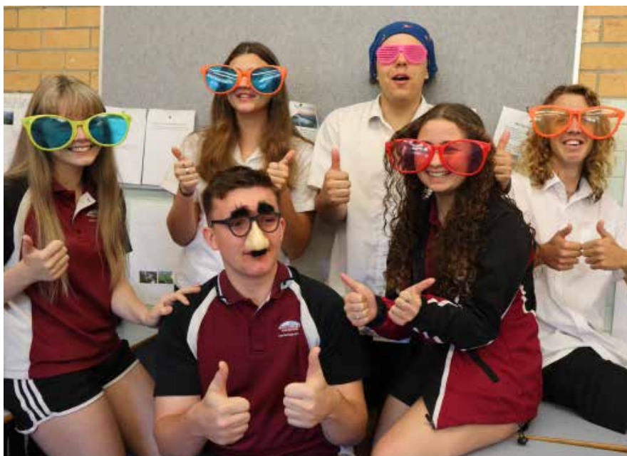
Photo below shows some of our senior students thanking our teaching staff on World Teacher's Day. We would all like to thank our THS teachers for their commitment and dedication.