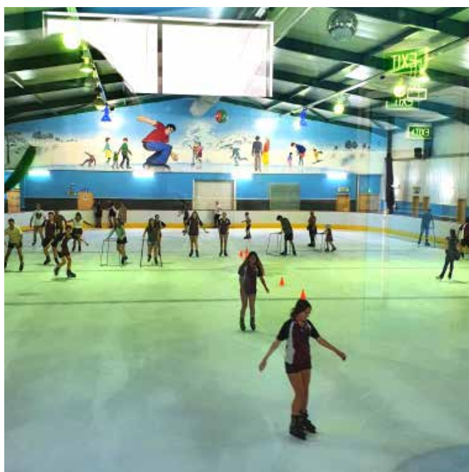
Year 10 Ice Skating

Last week Personal Development, Health and Physical Education and Sport, Lifestyle and Recreation students participated in a First Aid course.